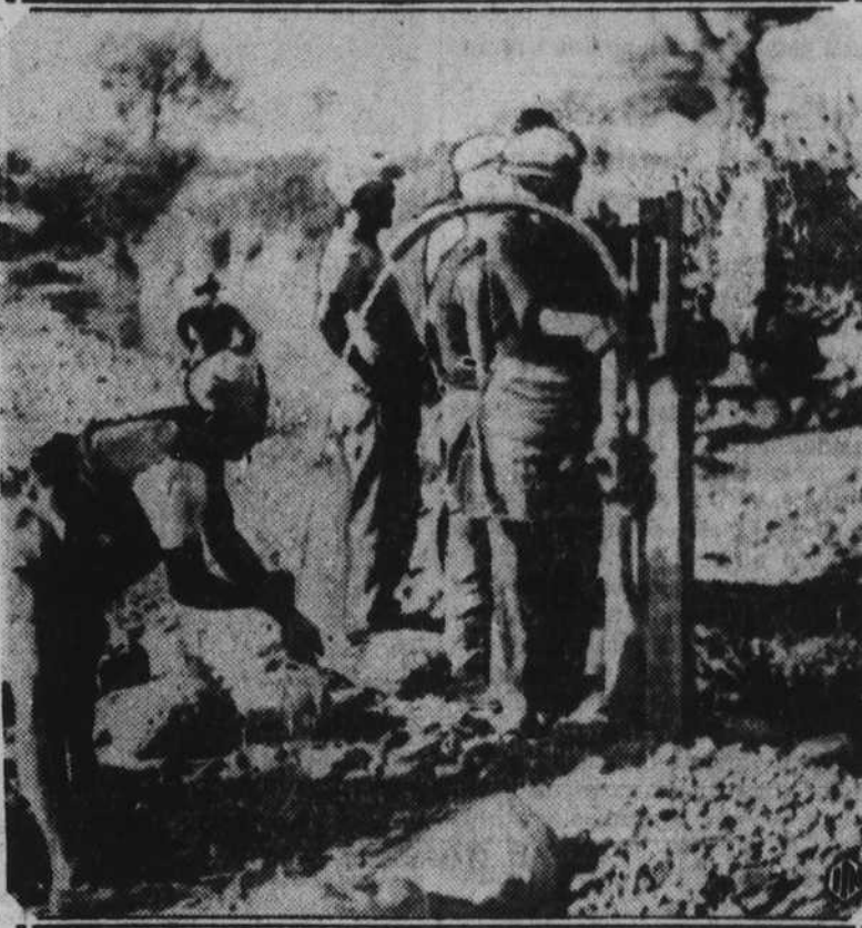
It is the task of a large corps of men to sink new wells in the wake of Italy's advancing troops in Ethiopia to provide the invaders with their all-important water supply. Water piped from one of the new wells is being tested, above. Shortage of water has been held as serious a threat to the Italian campaign as their Ethiopian opponents