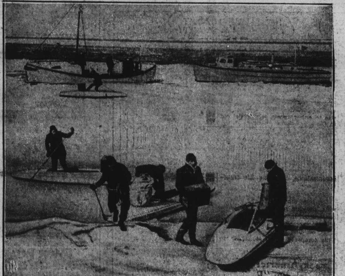
There's nothing in names as you can see here. These U. S. Coast Guardsmen are again playing the dual roles of samboists and life savers in bringing food and necessary supplies to the marooned winter residents of Fire Island, off the Long Island coast, where it is decidedly "not so hot" these days.