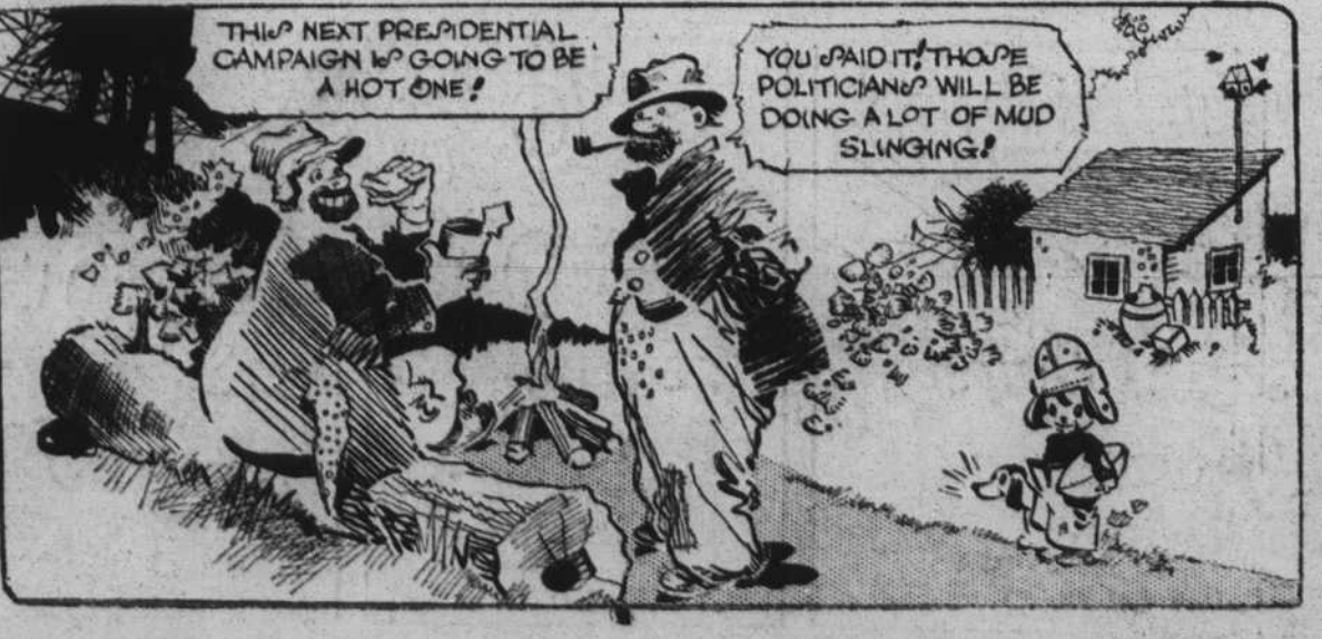
THIS NEXT PRESIDENTIAL CAMPAIGN IS GOING TO BE A HOT ONE!