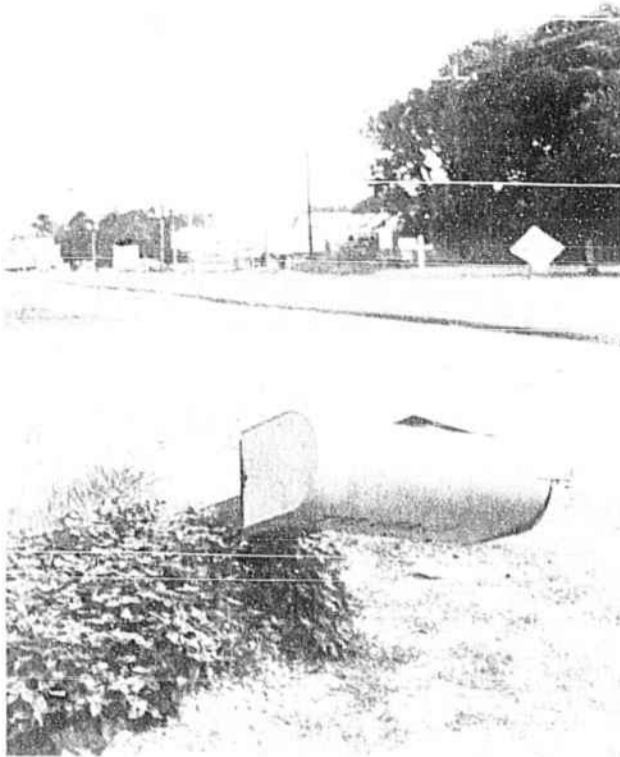
STRUCK DOWN IN ITS PRIME is this mail box on Holden Beach causeway. This was the fate of nearly a dozen mail boxes in that area when an adventurous vehicle cut a swath along the causeway and the shoulders of other roads Thursday morning.

He observed, "There are jags of this kind all over the county from time to time."