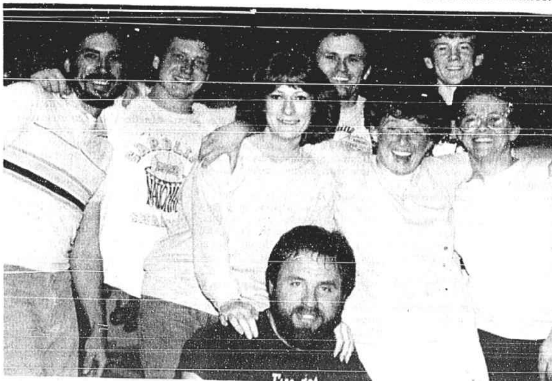
Win Volleyball Series

Pools—Pool Repair—Chemicals BRISSON POOLS 739-442 Lumberton 739-4024