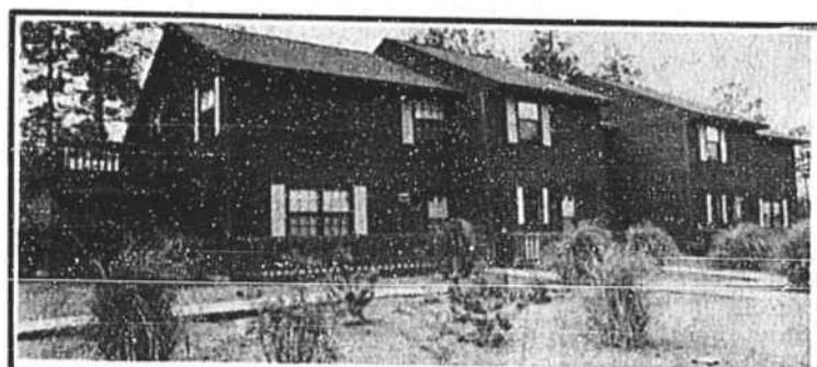
BRIERWOOD ESTATES —Extra nice 3-BR, 2-bath townhouse with Jacuzzi, large deck, screened patio, on No. 1 green. Many other features. Under $90,000. By appointment only. (919)754-9471.

Wooded deep water lot on Shallotte River in Copas Shores. Pool and tennis privileges. Three miles from shopping centers and golf course. Days call 754-6415. Nights 754-8790 or 754-8120.