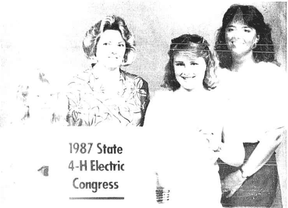
1987 State 4-H Electric Congress

She is employed by New Hanover Memorial Hospital, Wilmington, in The Birthplace.