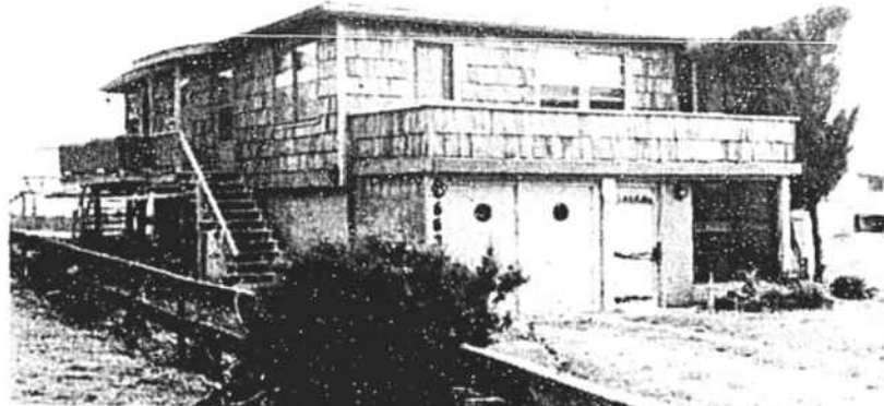
OCEANFRONT—3 BR, 2 baths, hardwood floors, tongue & groove walls, furnished, very clean. $129,900.