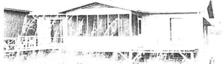
OCEANFRONT—4-BR, 2-bath furnished cottage with guttering, roof and paint job just 2 years old. Very good rental following. $144,500.