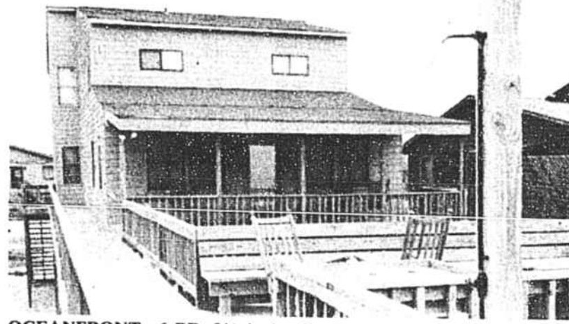
OCEANFRONT—6 BR, 3½ baths, furnished to accommodate 22 people. all amenities including C/H/A, DW, W/D, separate icemaker. Just 3 years old. Super rental! $310,000.