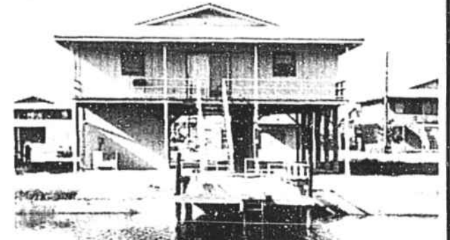
112 LIONS PAW DRIVE—One of the beach's better buys! 4 BR, 2 baths, all amenities. Good rental following. Just $97,500.