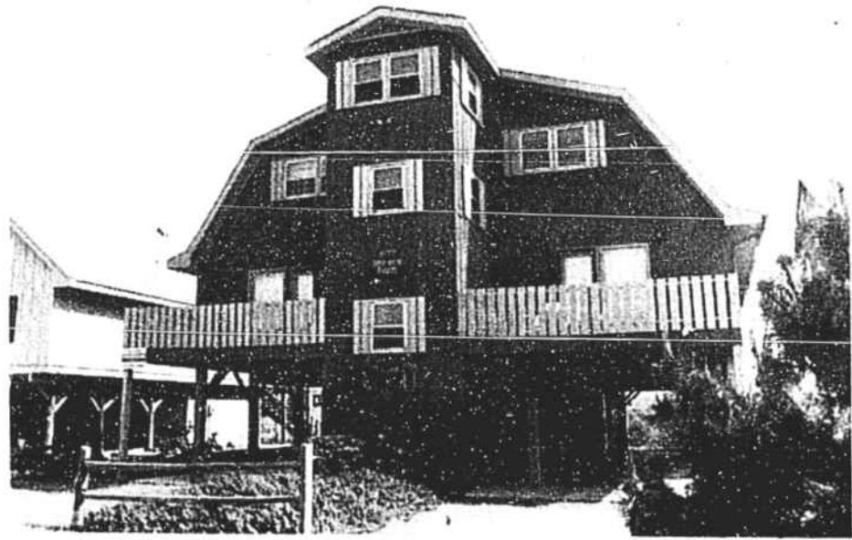
BAKER'S BARN, 597 OBW—Oceanfront, 6-BR, 3-bath duplex, furnished, W/D, C/H/A, carpet, landscaping . . . one of the island's best rentals. $249,900.

Here are some of our best buys on oceanfront and canal homes. Call us for a tour of these or any of our other fine listings.