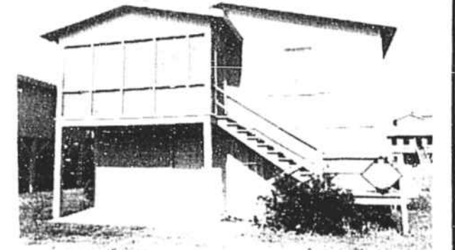
CANAL—150 Sand Dollar. 2 BR, 1 bath upstairs. Downstairs apartment has living room, kitchen, 1 BR, 1 bath. Furnished with C/H/A, W/D, boat dock, bulkhead. Backs up to marsh. Just $90,000.