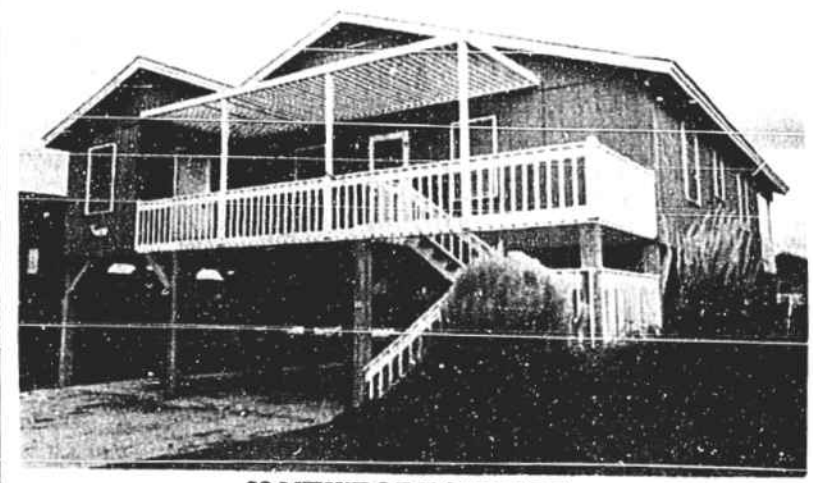
22 NEWPORT STREET

4-BR, 2-bath concrete canal home. Fully furnished, all appliances, beautiful bright colors, sundeck, boat dock, professionally landscaped. $125,900.