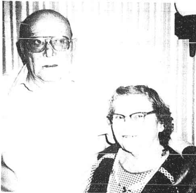
Married 55 Years

"Those times made it possible to get through the low times," she said.