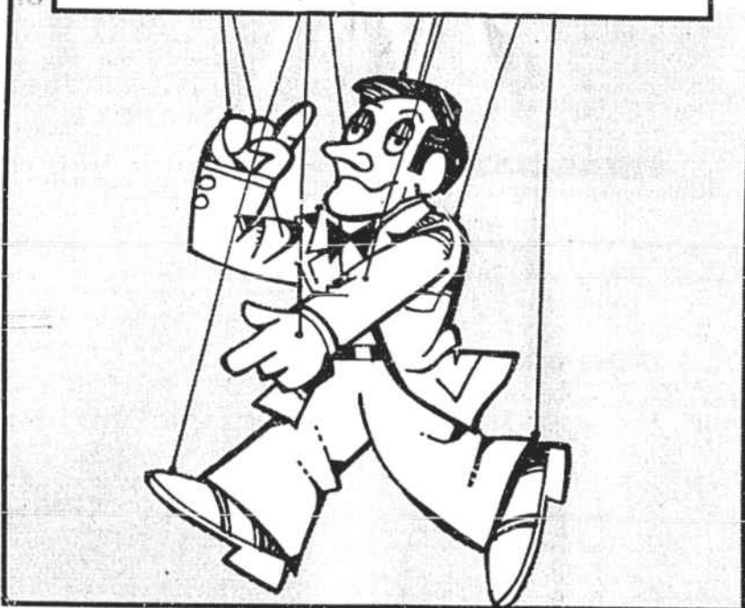
1988 THE BRUNSWICK BEACON

WORTHMORE HOMES MON-SAT 9-7, SUN 1-7 754-7676, HWY. 17 N., SHALLOTTE