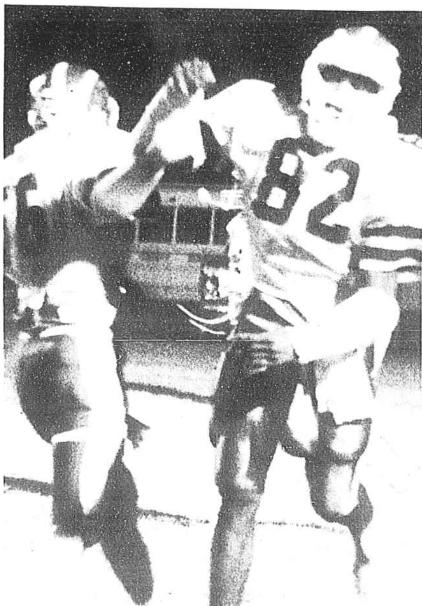
STAFF PHOTOS BY JOHNNY CRAIG