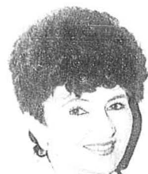
Evelyn Madison Home 754-6713

OCEAN ISLE BEACH CAUSEWAY, (919) 579-7038