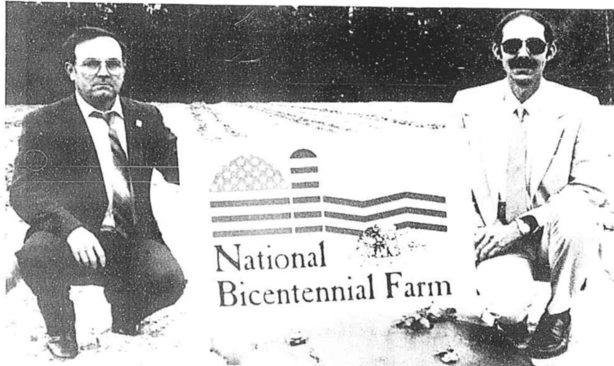
Holden Farm Is Honored

On Dec. 2, the CRC will consider a variance petition and a declaratory ruling request. Following those matters, reports from the four committees will be given.