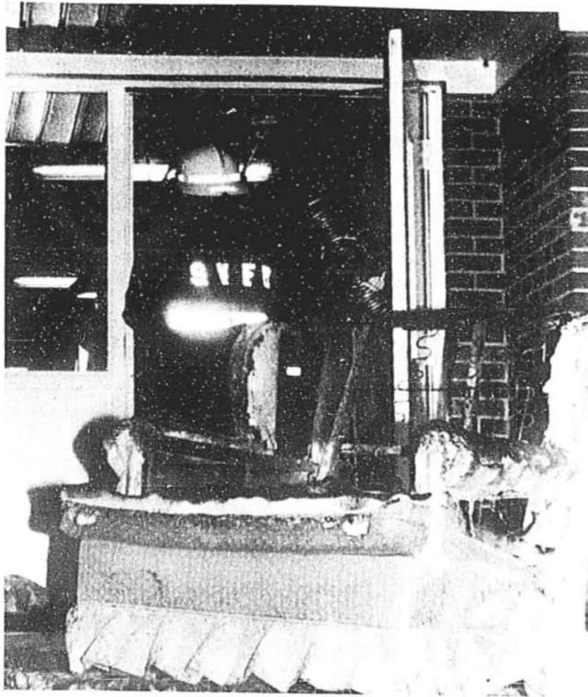
DAMAGE from a fire at Brunswick Village Residential Care Facility in Shallotte last Wednesday afternoon was limited to the west wing room where the fire began in this chair, which firefighters set outside.

I could not understand it. Then again, what can you expect from a bunch of Yankees?