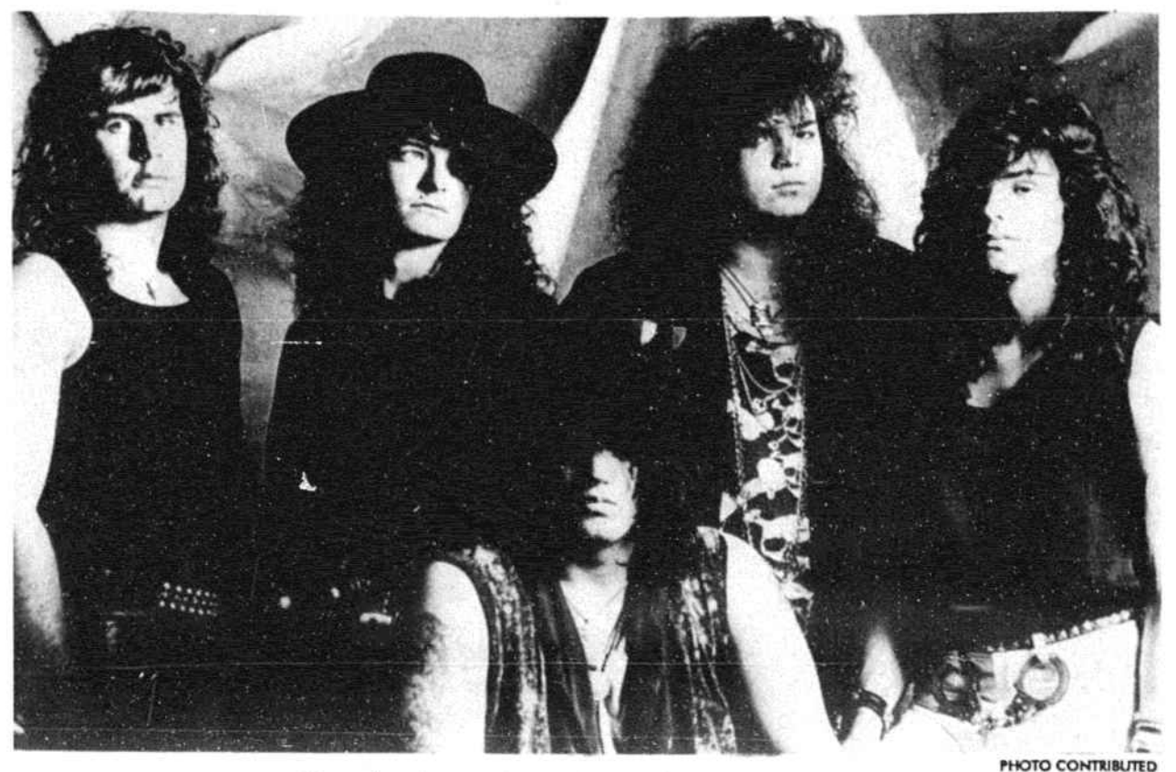
Rock Against Drugs At Dance

Members can combine registration of proxies with "Customer Appreciation Day" Tuesday, Oct. 24, from 10 a.m. to 2 p.m. at the coop office on N.C. 130 west of Shallotte. Employees will be serving free hot dogs and soft drinks.