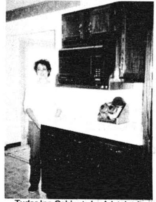
Tudor Inn Cabinets by Aristokraft