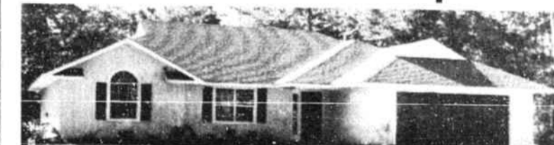
Laketree Shores--Lot #19, Hwy. 179, Ocean Isle Beach. House & lot.