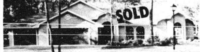
Lockwood Folly Golf Links--Lot 70, Holden Beach. House & lot.