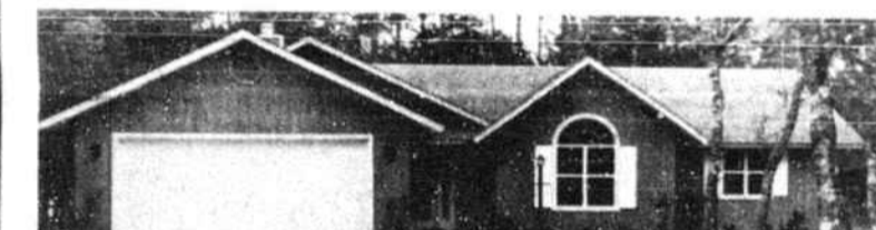
Laketree Shores--Lot #20, Hwy. 179, Ocean Isle Beach. House & lot.