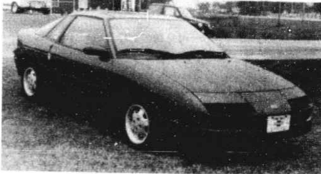
'90 GEO STORM