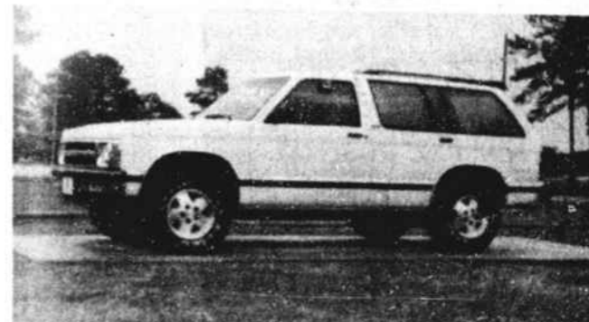
'91 S10 BLAZER 4 dr.