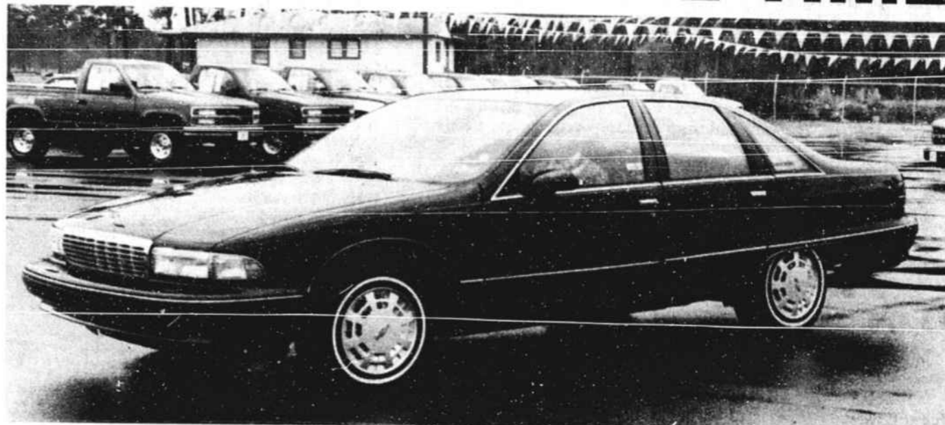
'91 CHEVROLET CAPRICE New Redesign