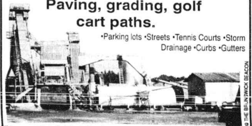
Asphalt Plant—2 miles north of Shallotte on Hwy. 17

•Parking lots •Streets •Tennis Courts •Storm Drainage •Curbs •Gutters