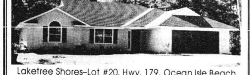
Laketree Shores—Lot #20, Hwy. 179, Ocean Isle Beach.