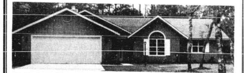
Laketree Shores—Lot #19, Hwy. 179, Ocean Isle Beach.

You can own gracious, distinctive craftsmanship.