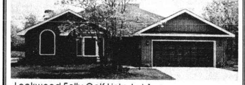
Lockwood Folly Golf Links—Lot 1 Holden Beach

90% FINANCING Available For Qualified Purchasers