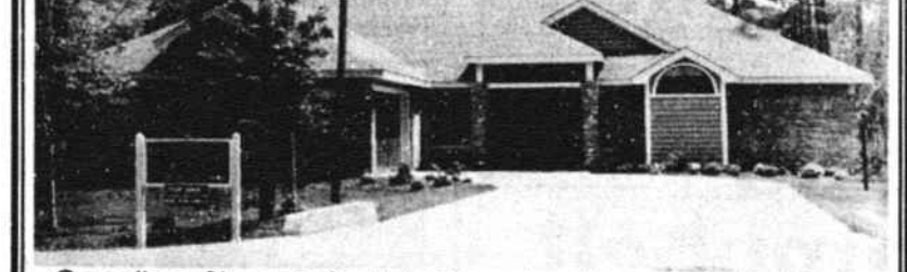
Carolina Shores Golf & Country Club—Lot 3A-65 Carolina Shores Parkway, Calabash.