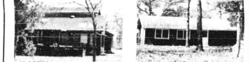
1.49 ACRES and spacious home, 3 BR, 2 baths. $89,500. SANDY SHOALS—2 BR, 1 bath, financing available. $34,500.