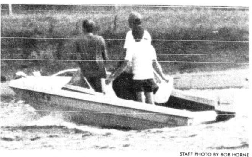
Stand For A Better Look

These youngsters were finding a cruise down the Atlantic Intracoastal Waterway to be a real treat.