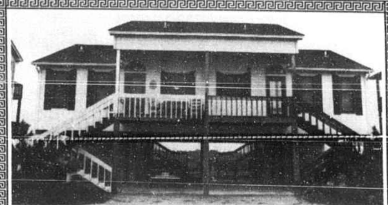
288 Brunswick Ave. West, Holden Beach Attractively designed duplex with 2 BR, 2 baths each side. Lots of extras and nice touches including 10-ft. ceiling in Great room and kitchen, transoms,