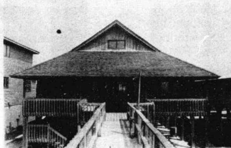
216 EAST FIRST STREET

Panoramic views and privacy with water on 2 sides. Quality 4-BR plus loft/den, screened porch, fireplace lots of extras. Furnished. $194,500.