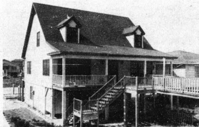
260 EAST FIRST STREET

Beautiful oceanfront home with 4 BR, 3 baths, gazebo. This home was built by our company and featured in Good Housekeeping magazine. It is a modified Cape Cod with over 2,000 sq. ft. $272,000.