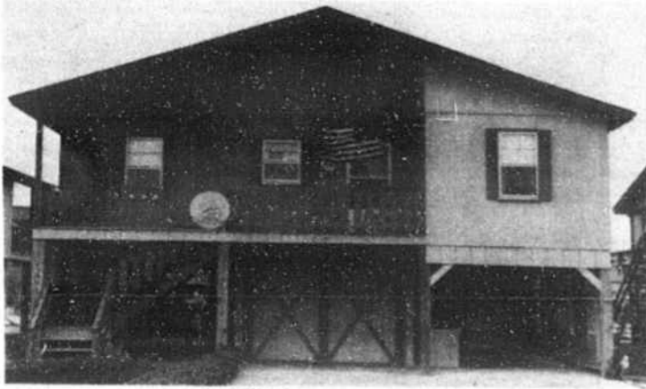
11 RICHMOND STREET

New listing! 4-BR, 2-bath canal home. One-owner, never rented. In excellent condition with lots of extras. Fireplace, screened porch, enclosed garage, extra large master bedroom. Recently painted and landscaped. On concrete canal with boat dock. A must see! $135,000.