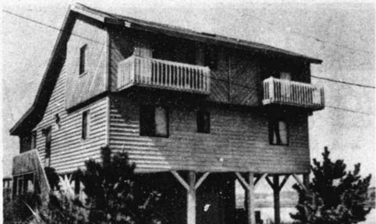
31 ISLE PLAZA

Beautiful oceanfront home with 4 BR, 3 baths, gazebo. This home was built by our company and featured in Good Housekeeping magazine. It is a modified Cape Cod with over 2,000 sq. ft. $272,000.