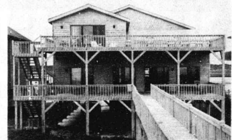
8 OCEAN ISLE WEST

Oceanfront, 5 BR, 2 baths, 2 heat pumps, very nicely furnished. Only 4 years old. $269,000.