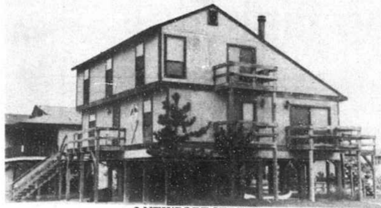
2 NEWPORT STREET

New listing! 4-BR, 2-bath canal home. One-owner, never rented. In excellent condition with lots of extras. Fireplace, screened porch, enclosed garage, extra large master bedroom. Recently painted and landscaped. On concrete canal with boat dock. A must see! $135,000.