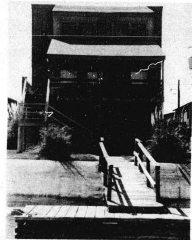
24 RICHMOND STREET—4 BR, 2-1/2 baths, new C/H/A, recently renovated and painted, some new furniture, covered porch, boat dock. $134,500.