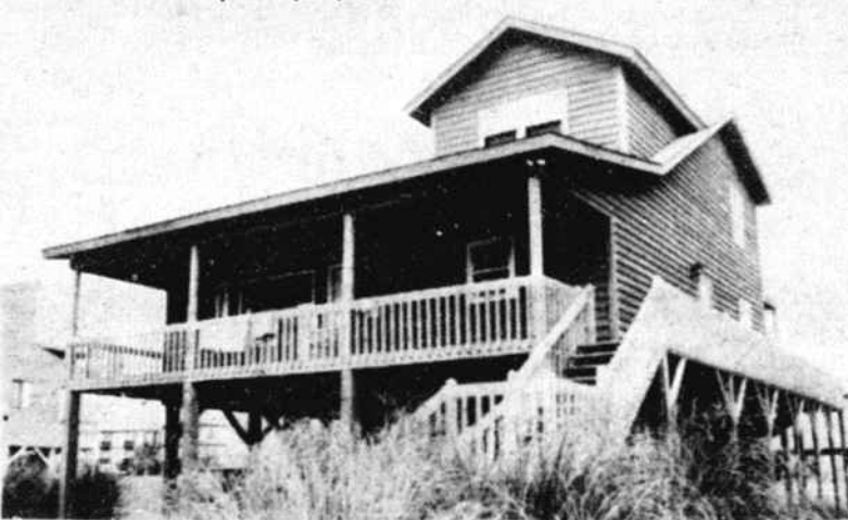
284 E. SECOND ST.—Beautiful third row house with 4 BR, 2 baths and loft. Appliances, blinds and curtains included. $123,000.