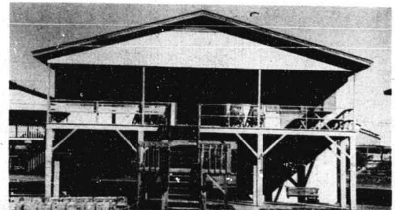
5 MONROE ST.—4 BR, 2-bath canal home. Fully furnished, new refrigerator and dishwasher, also washer/dryer. New C/H/A, covered porch, boat dock. House is in excellent condition. Direct access to ocean. Great buy at $134,500.

MARSH COVE —Large wooded lots with paved streets, underground utilities, septic tank permits. Restricted subdivision halfway between Shallotte and Shallotte Point. From $12,500 with owner financing. BENTREE PLANTATION —Beautiful wooded lots from $25,000. GAUSE LANDING —75x200, Lots 6 & 7, one block from waterway. $30,000 each. 75x214, Lots 15 & 16, two blocks from waterway. $22,000 each. SHADY OAKS —Pierce Street, 2 lots, only $11,500 each. BRICKLANDING PLANTATION —Several lots from $39,900.