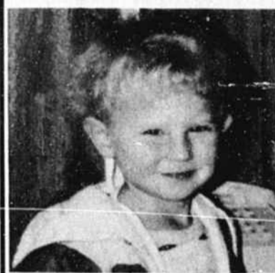
Love, Momma & Daddy