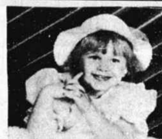
You Get All This