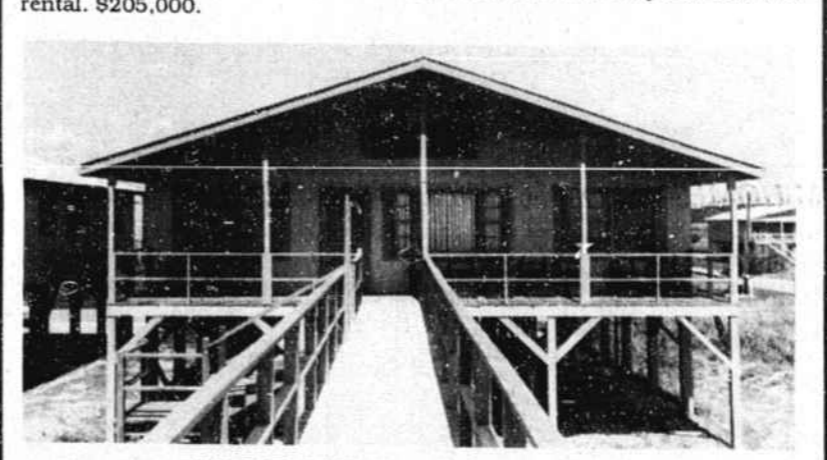
228 EAST FIRST STREET Oceanfront, 5 BR, 2 baths, furnished, C/H/A, excellent rental. $198,500.