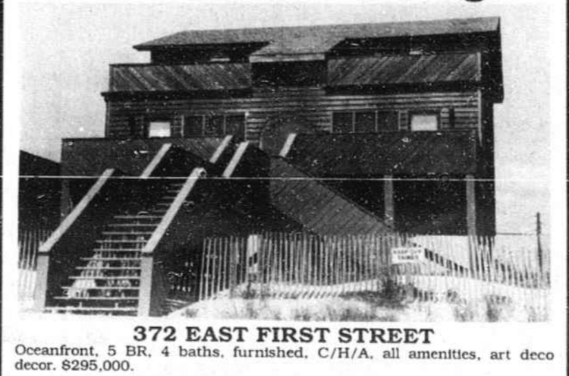
372 EAST FIRST STREET Oceanfront, 5 BR, 4 baths, furnished, C/H/A, all amenities, art deco decor. $295,000.