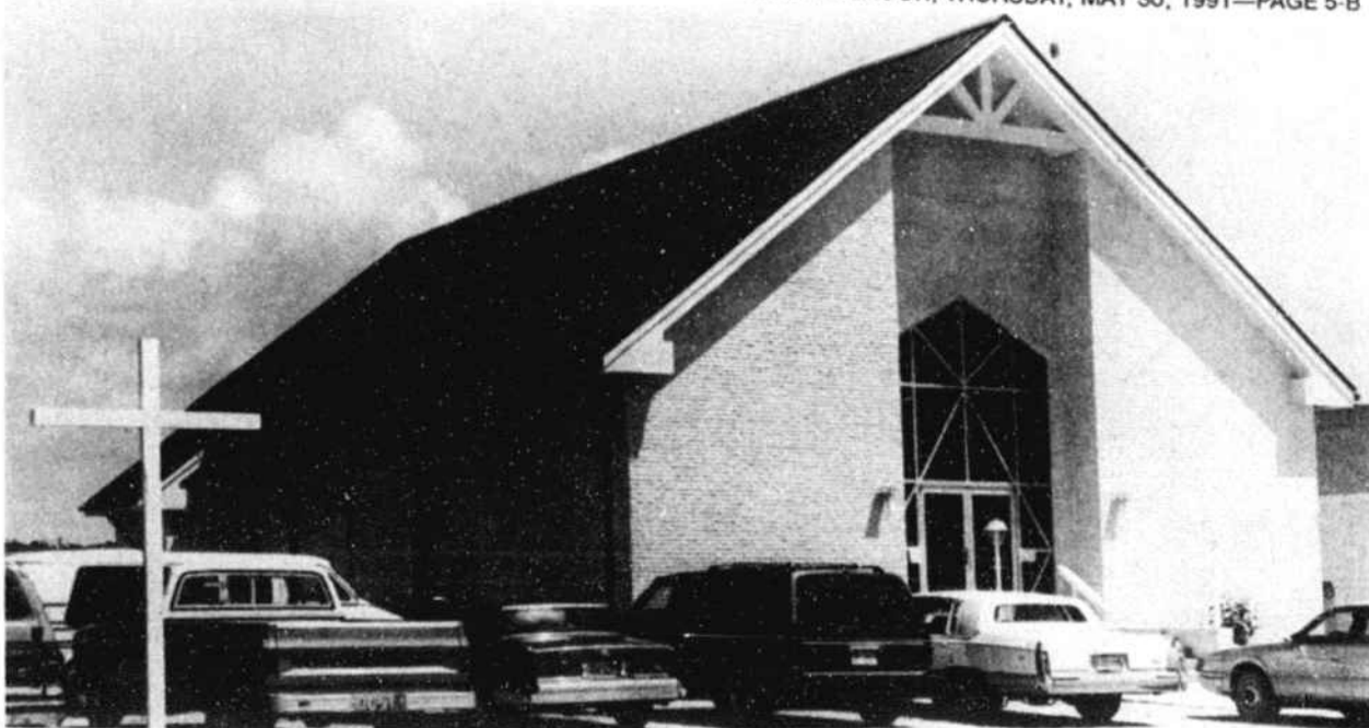
OCEAN ISLE BEACH CHAPEL will be dedicated Sunday at 11 a.m.