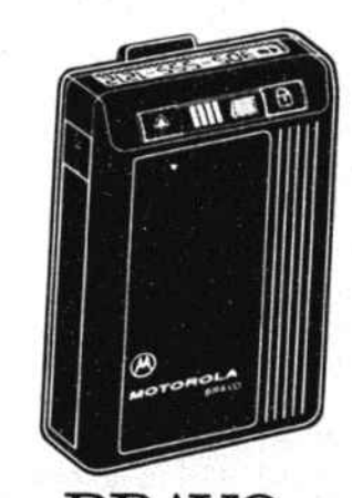
BRAVO Numeric Display Pager with Silent Vibration