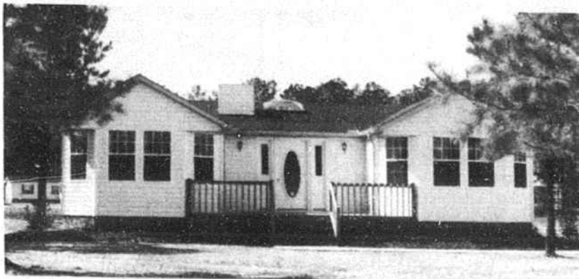
This model open daily 9-5.

We are the only community in our area to offer underground utilities, water and sewer, clubhouse, swimming pool, tennis courts and stocked fishing lakes. Adjacent to the clubhouse is a surprisingly different 18-hole miniature golf course designed for adults as well as children.