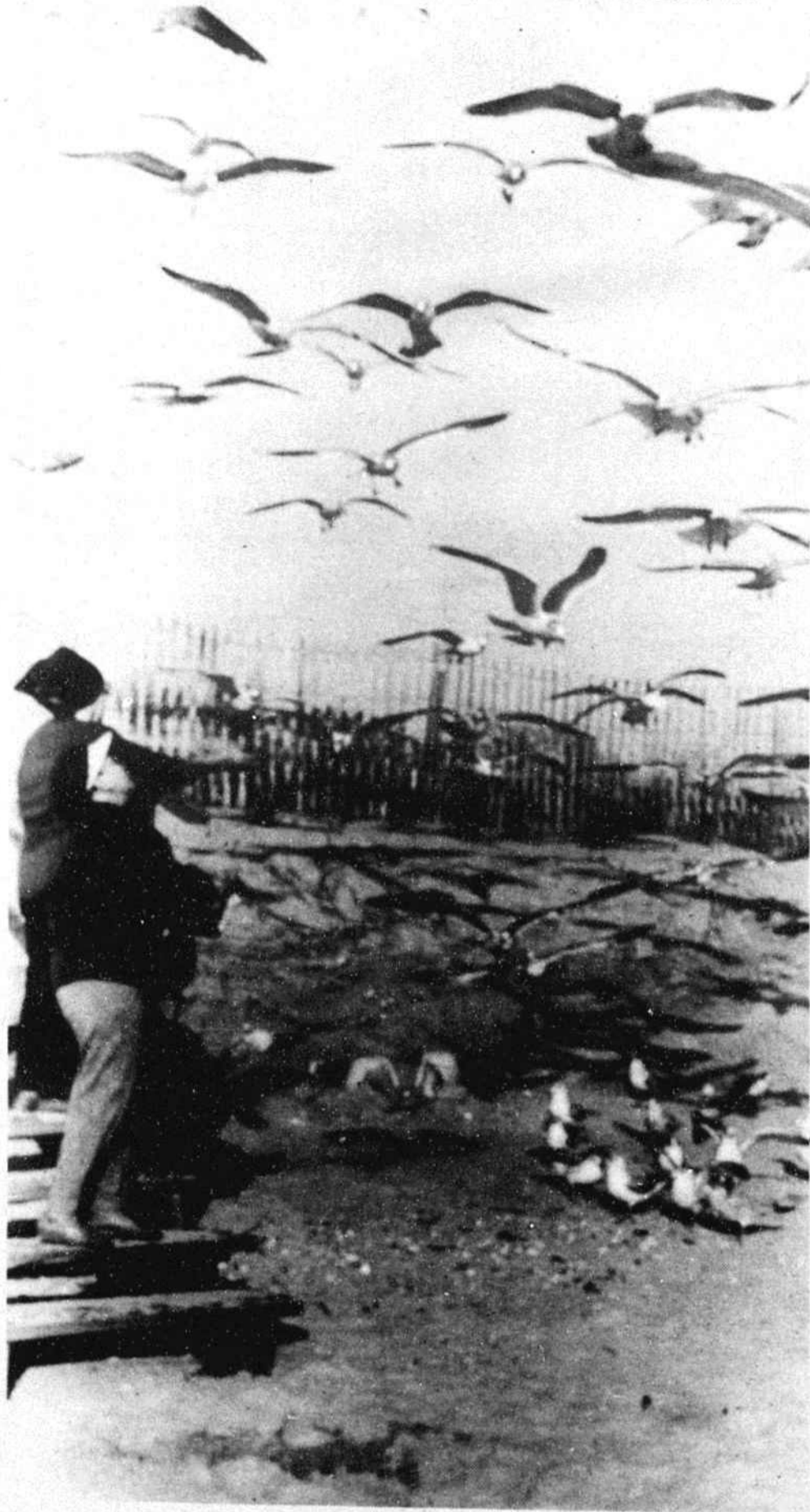
SCENES OF BEAUTY on Holden Beach are various and ever-changing with the seasons and the time of day. A convention of gulls, like these gathering for their banquet session, is a sight you can promote with a handful of bread crumbs.