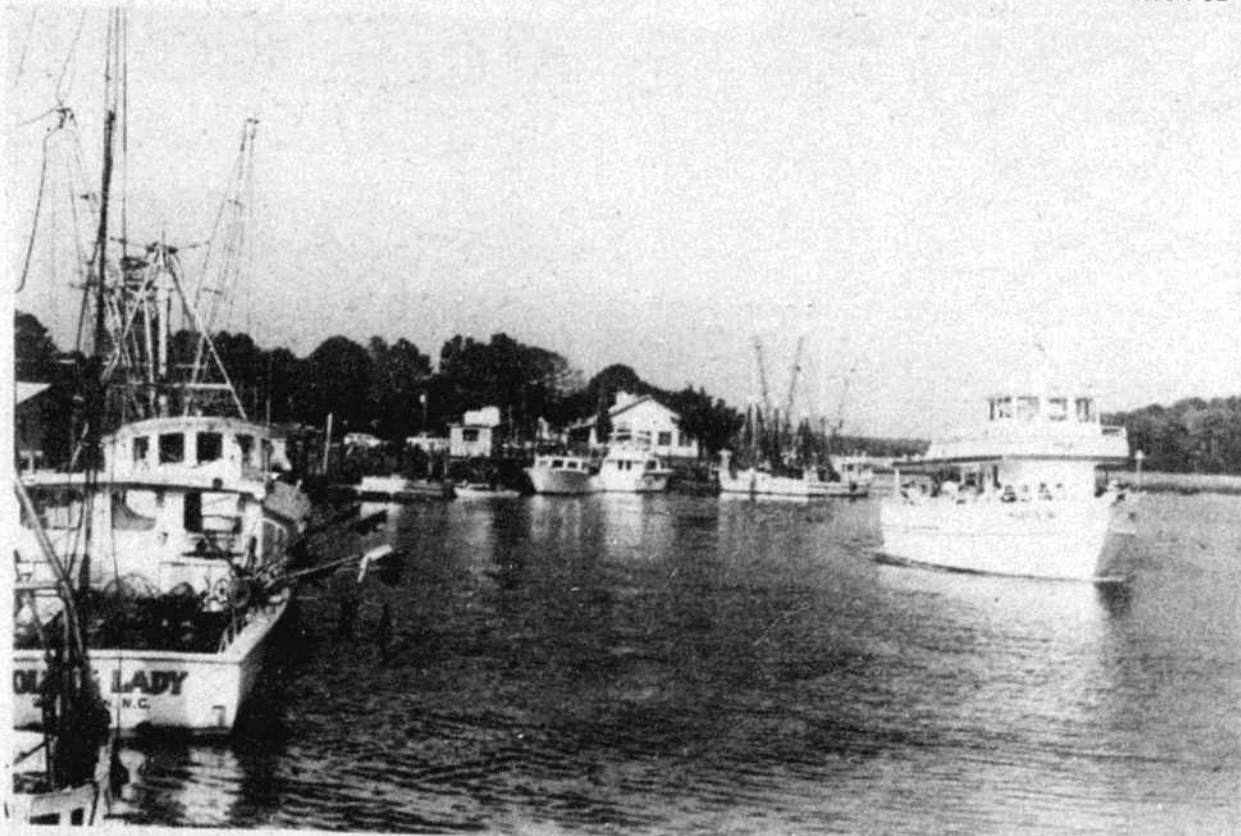
FISHING BOATS are the darlings of coastal artists, and these stand against a perfect backdrop, the graceful curve of the Calabash River. A visit to the Calabash waterfront can also yield a fresh supply of shrimp, just off the boat.

Pictured here are a few of the highlights of Beautiful Brunswick, scenic spots that are simply titillating samples of the county's aesthetic treasures.