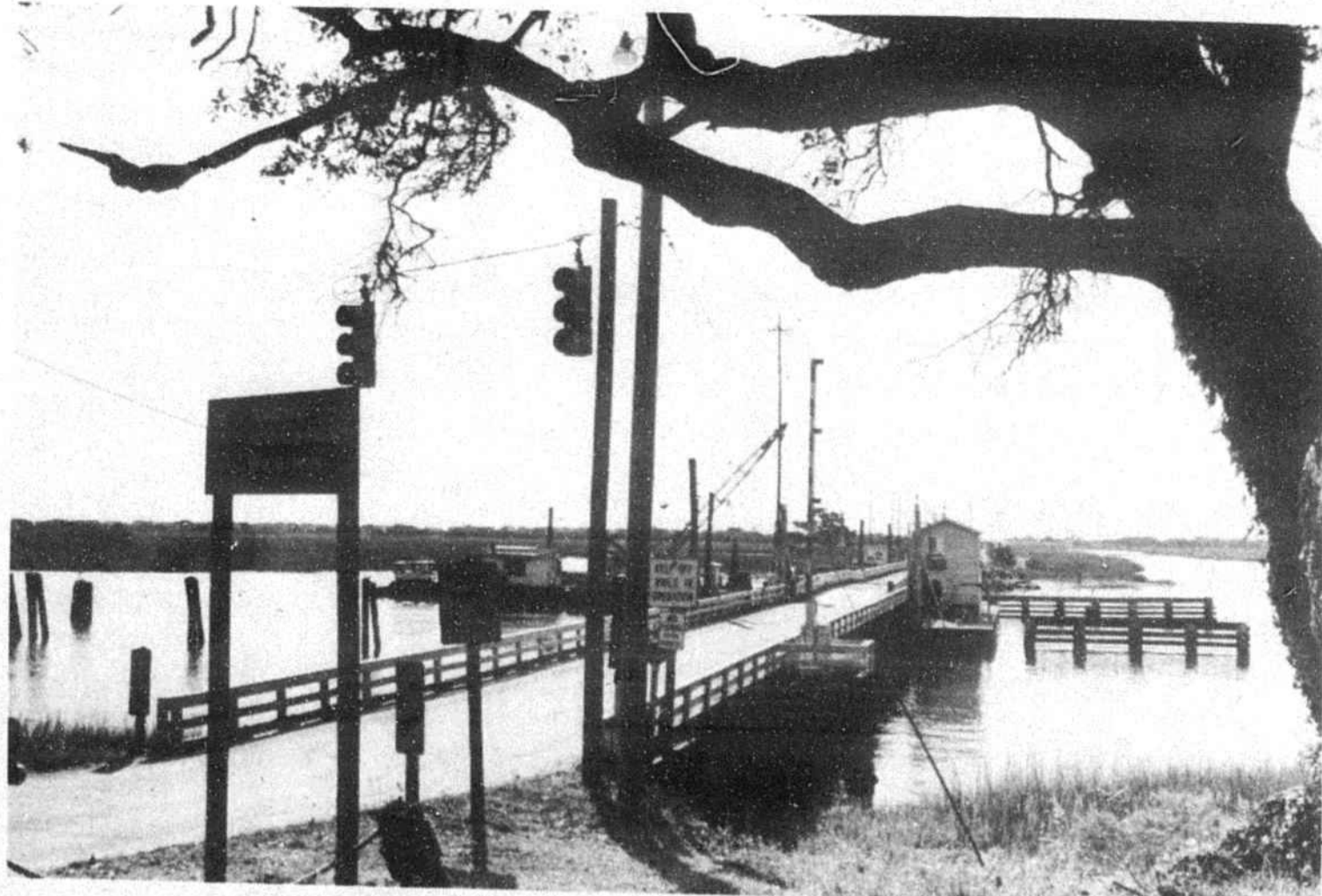
THIS CONTROVERSIAL BRIDGE sits picturesquely between the mainland and the island of Sunset Beach, oblivious to the outcry for its replacement. It's the only pontoon remaining on the eastern seaboard and a grand old lady whose operation is fun to watch.