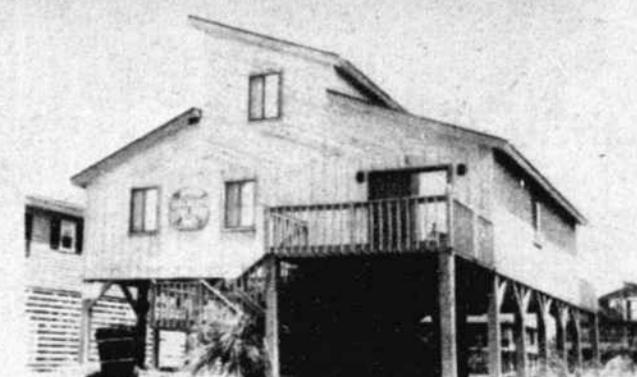
6 SCOTLAND STREET