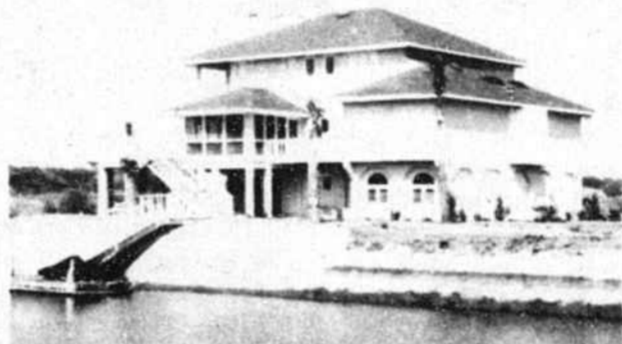
49 RAEFORD STREET

Oceanfront home with 4 BR, 2 1/2 baths, air conditioning units, ceiling fans, dishwasher, furnished. Good rental. $175,000.