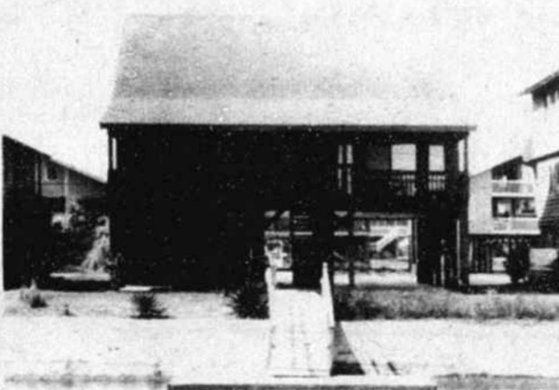
20 ANSON STREET

This is a beautiful home! 5-BR, 2-bath furnished canal home with boat dock, screened porch, large sundecks. $171,900.