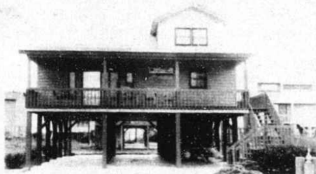
172 EAST SECOND STREET

Third row home with 4 BR, 2 1/2 baths and loft. Nicely furnished, fully rented. Easy beach access. $119,500.