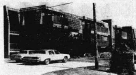
A PLACE AT THE BEACH

Oceanfront project in convenient location with pool and laundry facilities. Unit 22K, 2 BR, 1 1/2 baths, furnished, never rented. $70,000.