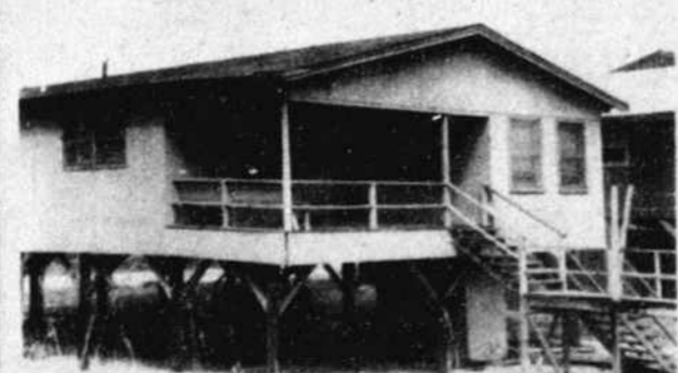
350 EAST FIRST STREET

4 BR, 2 1/2 baths, concrete canal, C/H/A, dishwasher, W/D, large deck, dock, screened porch. Good rental! Reduced to $159,900.