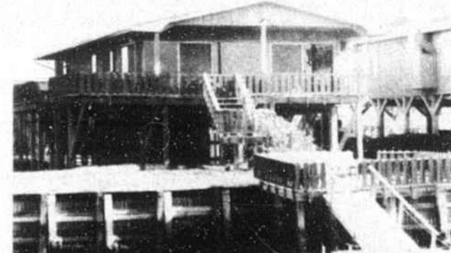
89 WILMINGTON STREET

Oceanfront project in convenient location with pool and laundry facilities. Unit 22K, 2 BR, 1 1/2 baths, furnished, never rented. $70,000.