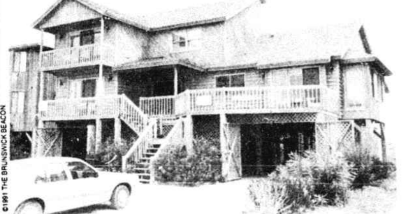
10 OCEAN ISLE WEST The perfect 10! 5 BR, 5 baths, gorgeously furnished. Ocean to sound lot with gazebo and boat dock. $495,000.