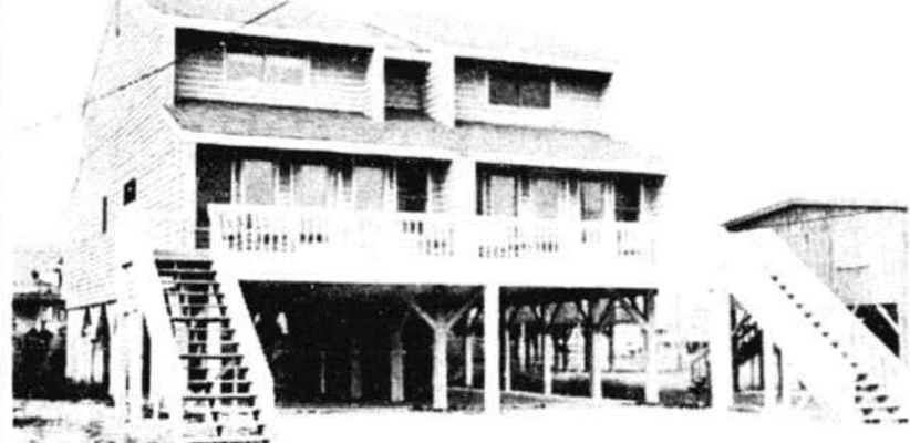
169 EAST FIRST STREET Half of a second row duplex. 3 BR, 2 baths, sundeck, storage room, excellent rental history. $97,500.

Let us show you... A Beautiful Place to Unwind.