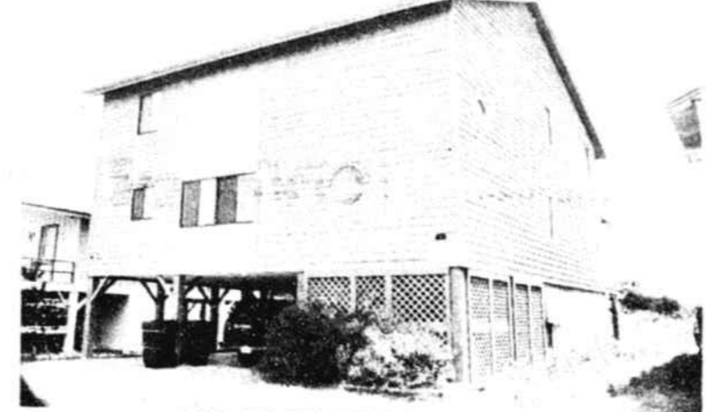
282 EAST FIRST STREET Oceanfront, 5 BR, 5 baths, extra sleeping areas, fully furnished and equipped, well-maintained, excellent rental history. $295,000.