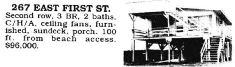
267 EAST FIRST ST. Second row, 3 BR, 2 baths, C/H/A, ceiling fans, furnished, sundeck, porch. 100 ft. from beach access. $96,000.