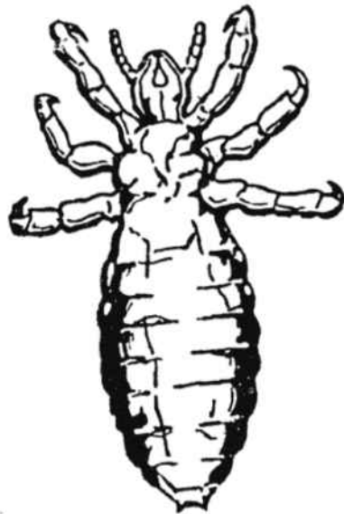
WHEN MAGNIFIED, the grasping opposing thumbs of the common head louse are easily seen.

If you notice that your children and/or family members are scratch-