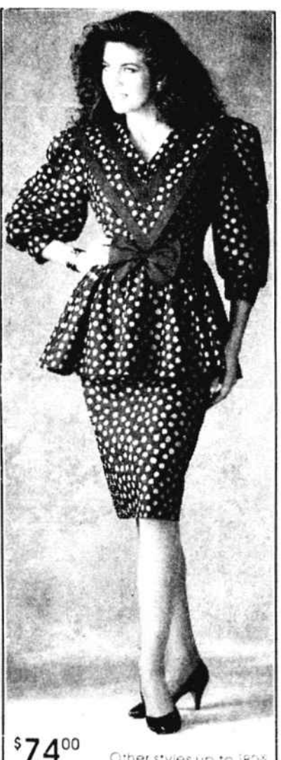
Other styles up to 180% Simply the best value dresses in America