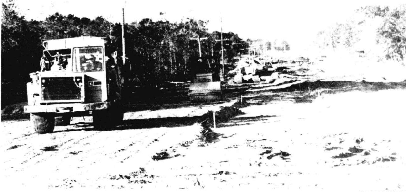
WORKERS WITH Dickerson Carolina Inc. are clearing land for two more lanes along a 5.3-mile stretch of U.S. 17 between Shallotte and Supply. Begun Aug. 6, the $4.7 million project should be completed by June 1, 1993. This work is just one of the projects under way along U.S. 17 from north of Bolivia to the South Carolina line.

Propst Construction Co. completed tie end grading and paving of the 4.8-mile Shallotte bypass Sept. 25. Cost, $3.86 million. Two other contractors had already finished their share of the work. Grading and irumage contract work by Vecellio & Grogan Inc. for 2.3 miles of the typass from N.C. 130 south was completed April 19, 1989 at a cost