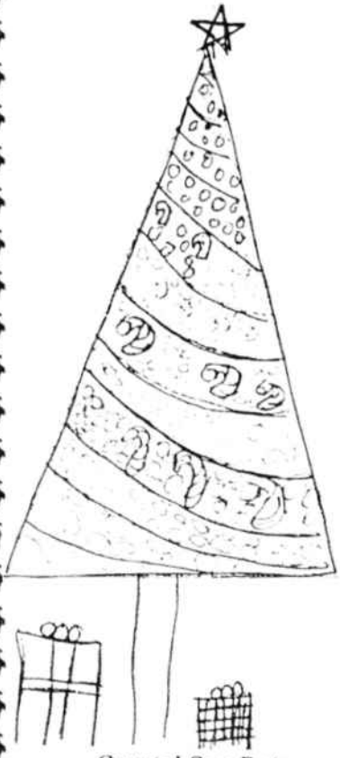
Crystal Sue Pate