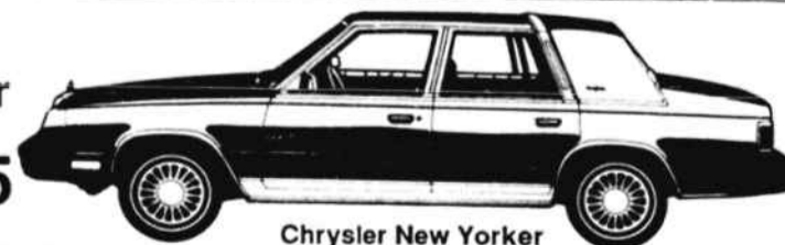
Chrysler New Yorker

'87 Chrysler New Yorker Luxury Equipped Reduced to $4,595