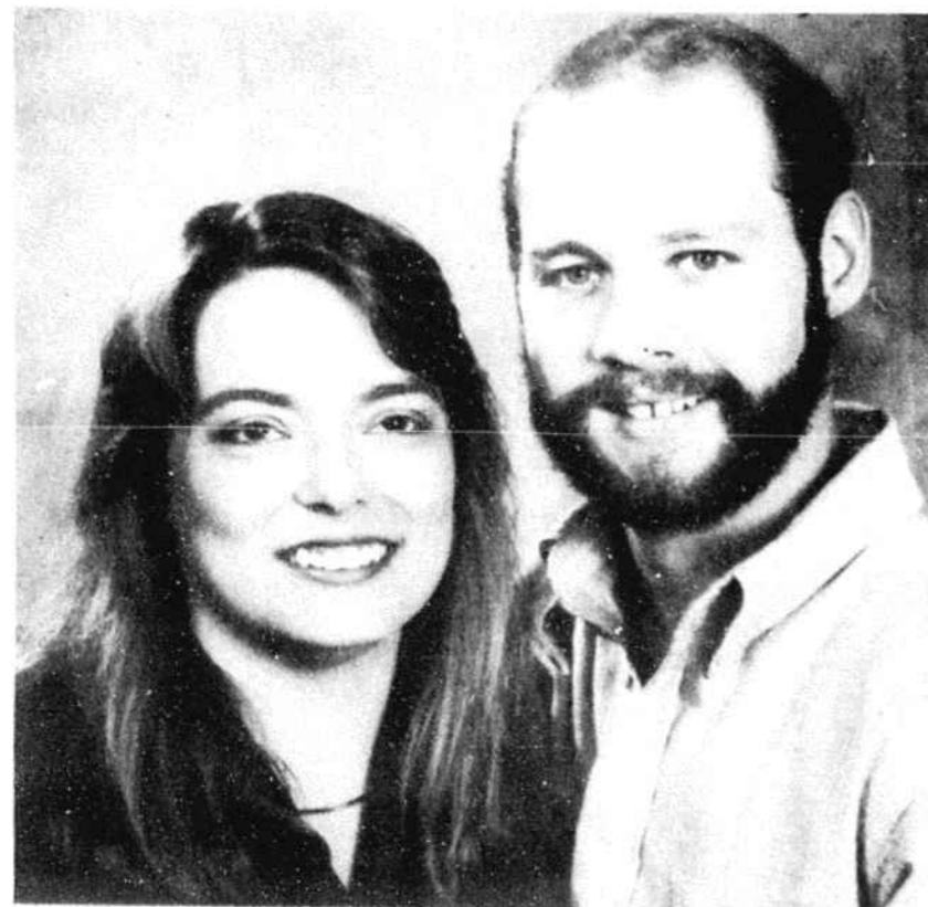
To Wed April 4

After their honeymoon, the newlyweds will reside in Hartsville.