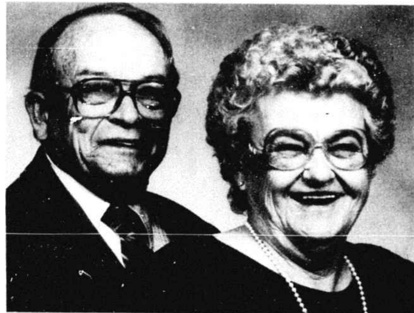
Married 50 Years