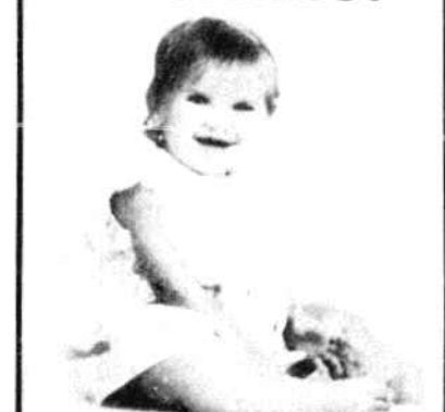
Love, Mommy and Daddy