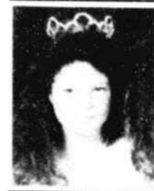
Chalmers Champion '91 Little Miss