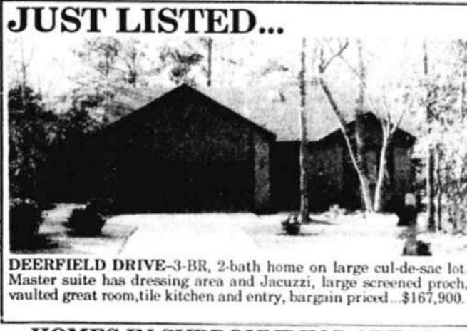
DEERFIELD DRIVE--3-BR, 2-bath home on large cul-de-sac lot. Master suite has dressing area and Jacuzzi, large screened porch, vaulted great room, tile kitchen and entry, bargain priced...$167,900.