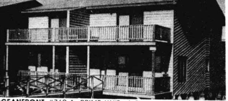
OCEANFRONT-#769-A, PRIME UNIT of Ocean Palms Townhouse Condominiums. 3 BR, 3 full baths, beautiful decor, swimming pool, private boardwalk to the beach and many extra amenities will make this your special home away from home! Excellent rental income-producing property. $172,500.

OVERLOOKING this view of the Shallotte River on a beautiful sloping extra large lot is a furnished 2-BR, 2-