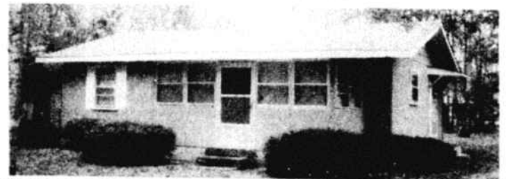
Waterway Community with boat ramp, fishing pier-Cozy furnished vacation place with 3 BR, glassed in porch. Electric baseboard heat/window AC. Boal house (water, e electricity.). Only $59,900.