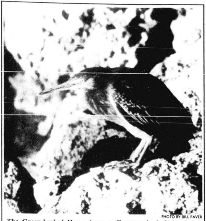
The Green-backed Heron is a small, crow-sized, dark-colored