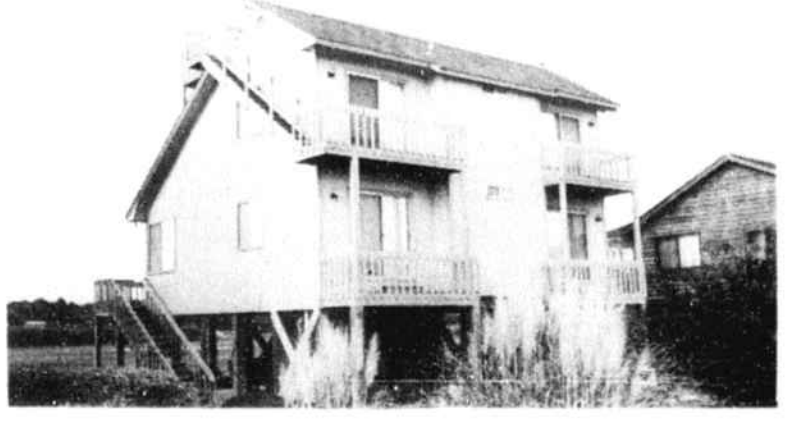
121 Schooner Drive 4 BR, 2 baths, rose interior, wonderful view of waterway and marsh. ..$149,900.