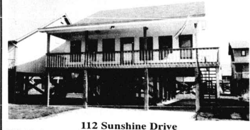
3 BR, 2 baths, new construction, teal interior, all amenities... $124,900. MAINLAND HOMES