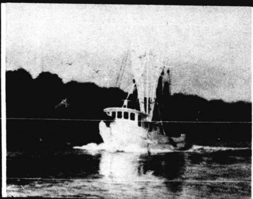
"COMING HOME," NEW LIMITED EDITION PRINT BY TERRY SELLERS IMAGE 16"x19", 750 SIGNED & NUMBERED, $45 EACH

754-6199 • Mon.-Fri. 10-6, Sat. 9-1 Located In Resort Plaza, Bus. 17 S., Shallotte