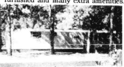
Summer Place II—Randy Street. This 12x55 Winston mobile home has 3- BR, 1 bath, storage building on 2 lots. $19,500. ONE SIDE UNDER CONTRACT

We are located at 111 Jordan Blvd. on Holden Beach • (919)842-4820 Open 7 days a week from 9 AM to 5 PM