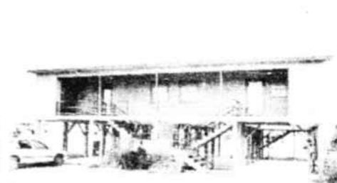
347-B Brunswick Ave.—West side only. 2 BR, 1 bath, completely furn- ished. Popular rental unit for $69,900.