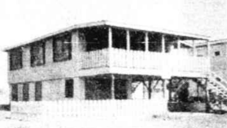
123 Ocean Blvd. East—Duplex. Upstairs has 3 BR, 1 bath and new furniture. Downstairs has efficiency apartment. Good rental unit. $92,000.