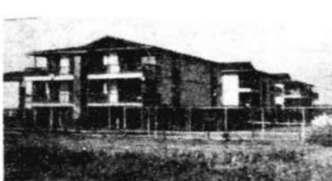
Captain Villas #6-C—Located at 1068 Ocean Blvd. West with adjoining oceanfront property. 2 BR, 2 baths. Villas have swimming pool and tennis courts. $95,500.