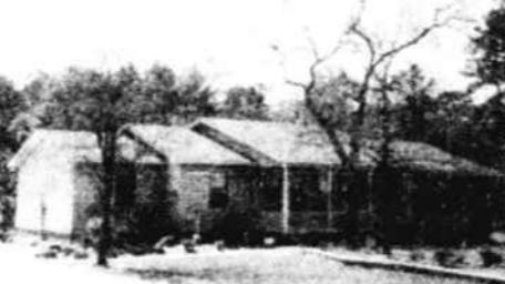
Riverside Estates—Restricted subdivi- sion. 3 BR, 2-bath custom built home on 2+ lots. Only 3 years old. $98,500. Owner wants offer!