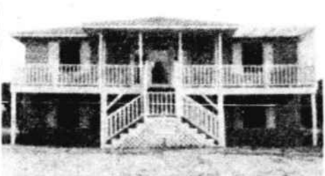
192 Sailfish Drive—Newly remodeled 4-BR, 2-bath home facing ICW and canal behind with floating dock and bulkhead. $189,500.