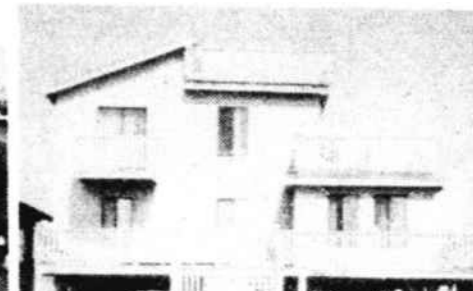
566 Ocean Blvd. West—3 year old, 4- BR, 2-bath home with canal in back including a floating dock. Completely furnished and many extra amenities.