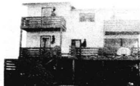
161 Brunswick Ave. West—3 year old home. 4 BR, 2 baths, 2 story with decks on both levels. $159,900.