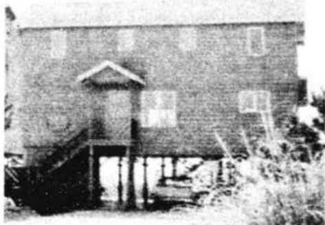
623 Ocean Blvd. West—Oceanfront, 4- BR, 3-bath, 2-story home, completely furnished and nicely decorated. Excellent rental history. $229,500.

537 Ocean Blvd. West— Oceanfront lot in excellent location. Approximately 60x250. 4 BR, conventional septic tank permit, ready for your home. Offered at $140,000.