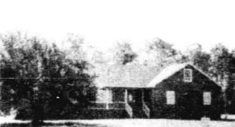
Riverside Estates—NEW LISTING. Restricted subdivision. 3 year old, 3 BR, 2 baths, garage plus many extras. $95,500.