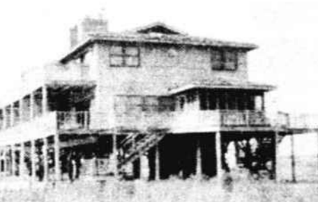
Holden Beach West—1260 Ocean Blvd. West—Duplex. Each side has 3 BR, 3 baths and decks to view ocean, waterway and inlet. Excellent rental unit. $375,000.