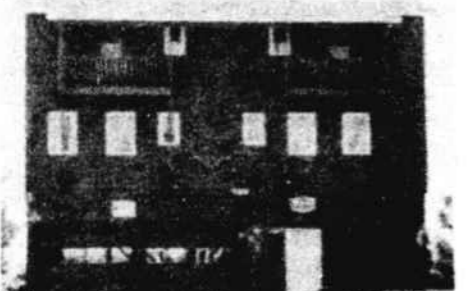
739 Ocean Blvd. West—Oceanfront home has 4 BR, 4 baths with decks on oceanside, boardwalk to beach and seating area. Completely furnished. $249,500.