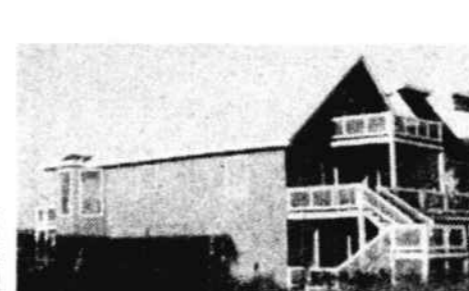
314 Sandpiper Lane—Located 1 block from ICW. 3 BR, 2-bath, 2-story home enclosed underneath with utility room and workshop. Excellent loan as- sumption. $89,500.