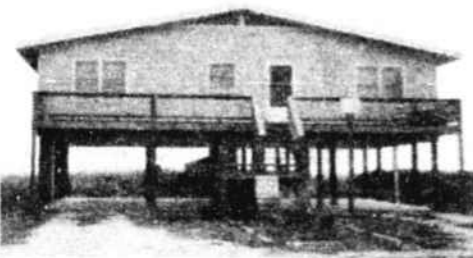
115 Ocean Blvd. West—Oceanfront, 4 BR, 2 baths, completely remodeled and newly furnished. Excellent rental property. $189,500.