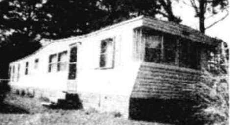
Near Shallotte on Hwy. 130—1975 Greenwood mobile home. 2 BR, 1 1/2 baths. Located in good neighborhood. $12,500 with owner financing possible.