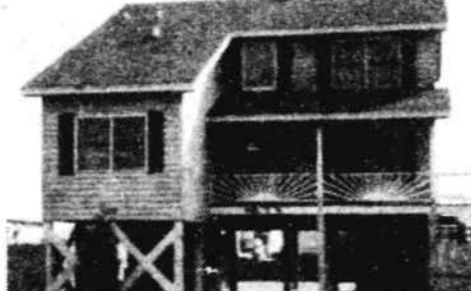
227 Brunswick Ave. West—Attractive 3-BR, 2-bath 2-story home. Very good rental history or perfect for year 'round residence. $124,500.