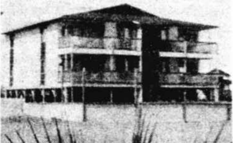
Captain Villas #8-B—Located at 1068 Ocean Blvd. West. Unit has 2 BR, 2 baths including use of swimming pool and tennis courts. Rental income is excellent. $85,000.