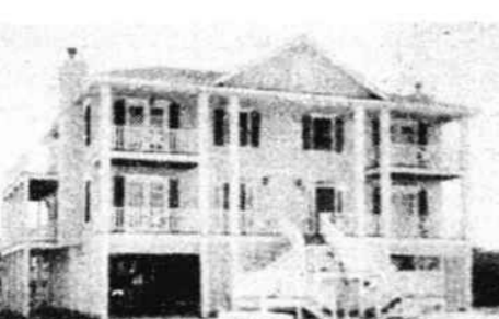
Holden Beach West—Southern Colonial duplex—side 2 BR, 2 baths, 2 story. ONE SIDE UNDER CONTRACT sale at $139,500. ONE SIDE UNDER CONTRACT with owner financing available.