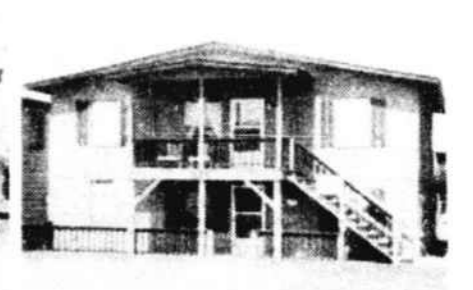
920 Ocean Blvd. West—Duplex. Upstairs has 4 BR, 2 baths and completely furnished. Downstairs has 3 BR, 2 baths and furnished. Excellent rental history. $139,500.