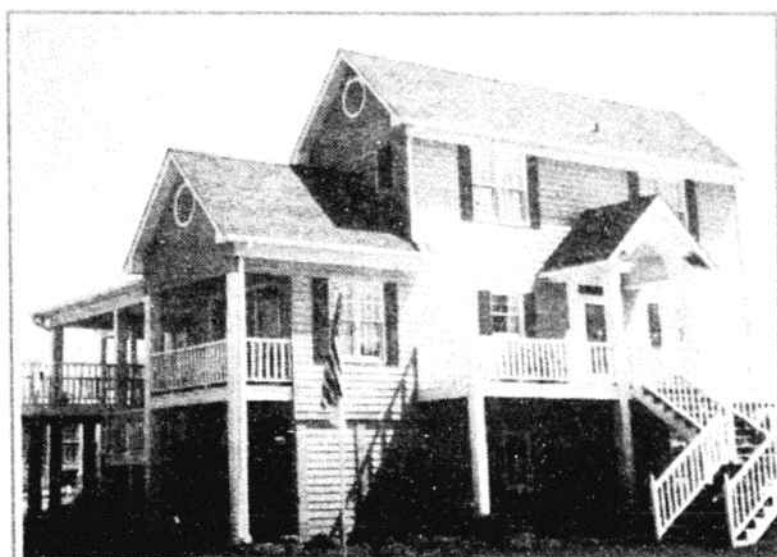
HAL AND MARDY SELLERS