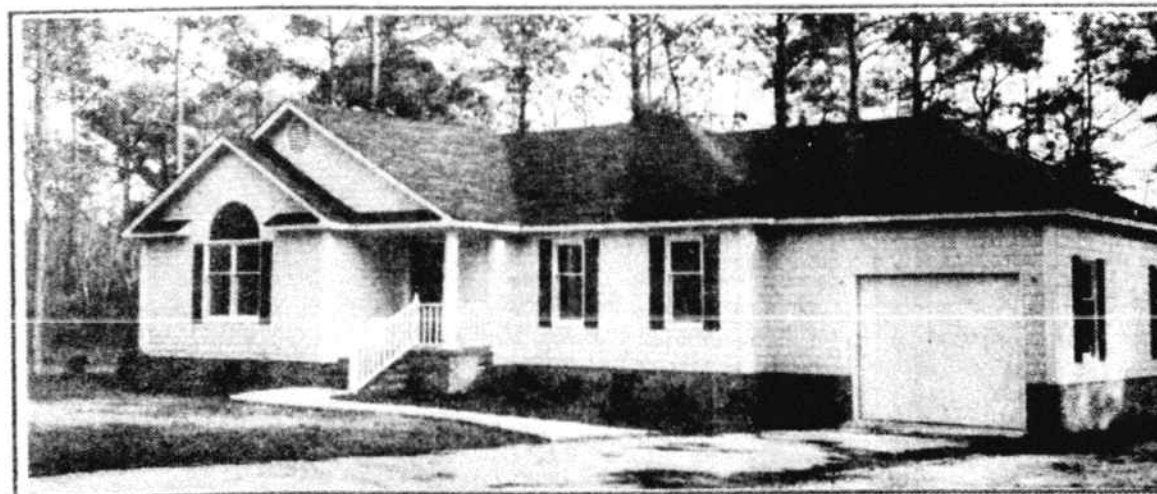
NEW HOME FOR SALE, RIVERSIDE