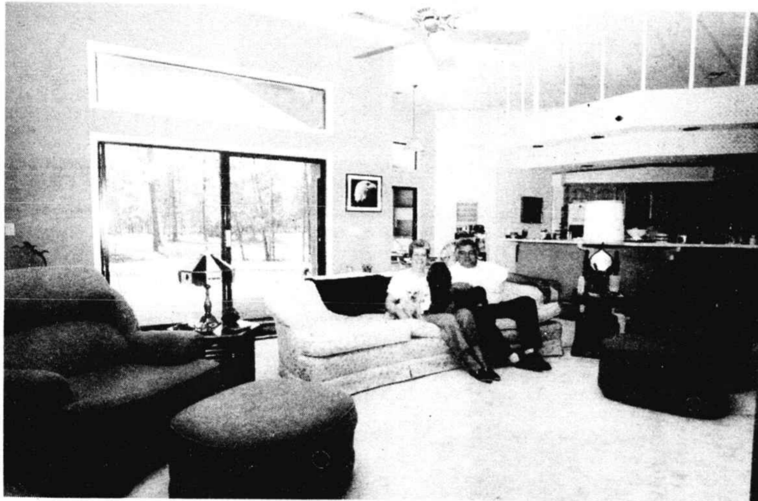
CARL AND RITA SAPIENZA, pictured with pets Brandy, Gigi and Boomer, spend most of their time in this comfortable room, which provides easy access to the kitchen (right) and back porch.

master bedroom is on one side of the house and two of the spare bedrooms are on the other. Guests have their own bathroom and own doorway to the porch and pool out back.