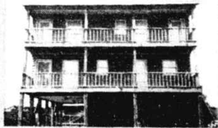
143 Dolphin St.—Canal home, 3 BR + loft area. 2 baths. Beautifully decorated, convenient beach access. Many other extras. $158,900. Call Connie.