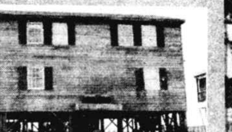
321 Ocean Blvd. West-Oceanfront duplex. Each side 4 BR, 3 baths. Excellent rental history, well-maintained. $269,000. Call Pat.