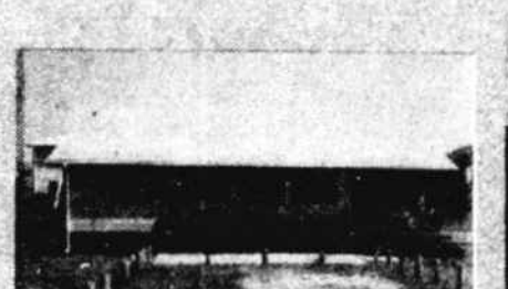
182 Ocean Blvd. East—3 BR, 2-bath home with excellent ocean view, knotty pine interior walls, all appls. C/H/A. $89,900. Call Pat.