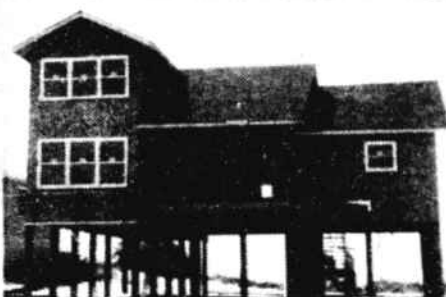
142 Ocean Blvd. East-Oceanfront, 4 BR. Now under construction—will be ready for the 1992 rental season. $194,900. Call on-duty broker.