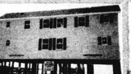
140 Ocean Blvd. East—Duplex, 2 BR each side. Under construction, buy now & select the finishing touches. $144,900 each side. Call Broker.