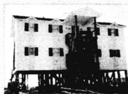
138 Ocean Blvd. East-Oceanfront. Lower level duplex, 2 BR, 2 baths. New in '91. Buy now and enjoy rental income. $139,900. Call Broker.