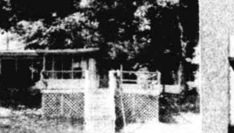
Windy Point—3 BR, 2 baths, carport, 158 ft± lighted pier leading to private sundeck on ICW. This is a must see. $125,000. Call Linda.