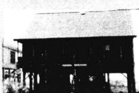
693 Ocean Blvd. West-Oceanfront, 4 BR, 4 baths. Excellent condition, exceptional rental history, 2 oceanfront porches. $250,000. Call Diane.