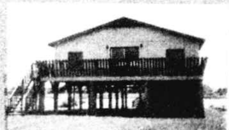
Sea Aire Canal—On ICW. 4 BR, 2 baths. Bulkhead, boathouse, boat lift, floating dock, sundeck, unmatched views. $139,900. Call Linda.