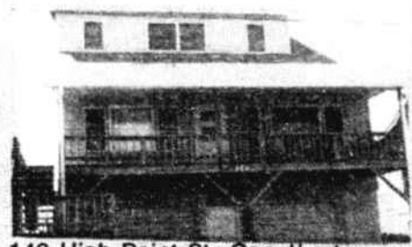
149 High Point St.—Canal/waterway. Custom-built home for year 'round living. Many extras. Floating dock. REDUCED $199,900. Call broker.