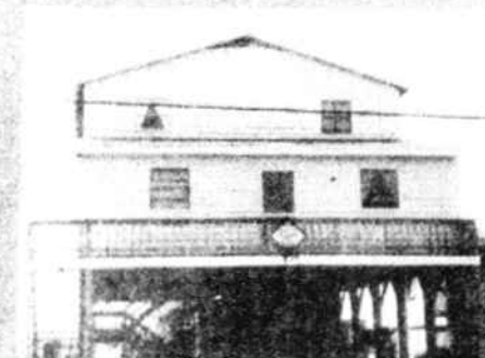
877 Ocean Blvd. West-Oceanfront duplex. Lower unit: 4 BR, upper level has 2 BR. Fully furnished, excellent rental history. $199,500. Call Connie.