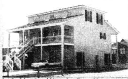
149 Yacht Watch Dr.—New construction, plenty of extras. 3 BR, 3 1/2 baths, rooftop sundeck, landscaped lot. Must see. $179,900. Call broker.